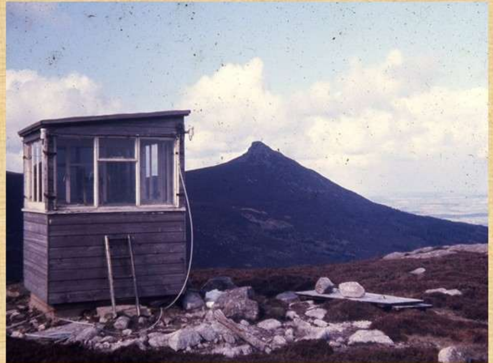
Millstone Hill fire hut 1972

Mid 1970's - the office merged with Pitfichie Forest Office and relocated to Tilliefourie .